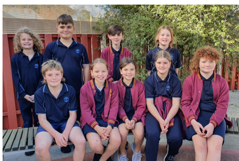
Candidates for Confirmation & Eucharist: