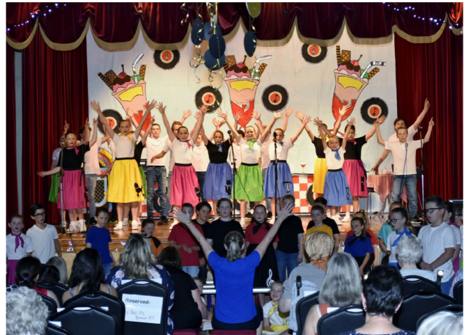
The cast of St Mary's Cohuna Production of Jules