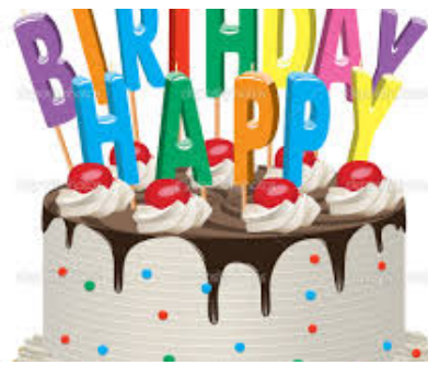
.Jimmy Gelletly - 17th Charlie Hauser - 17th