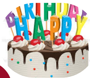
Caelan Appleby - 2nd